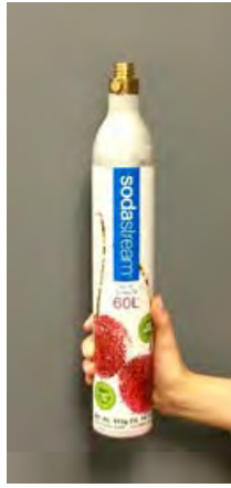
Figure 1: SodaStream TC-3ALM Cylinder