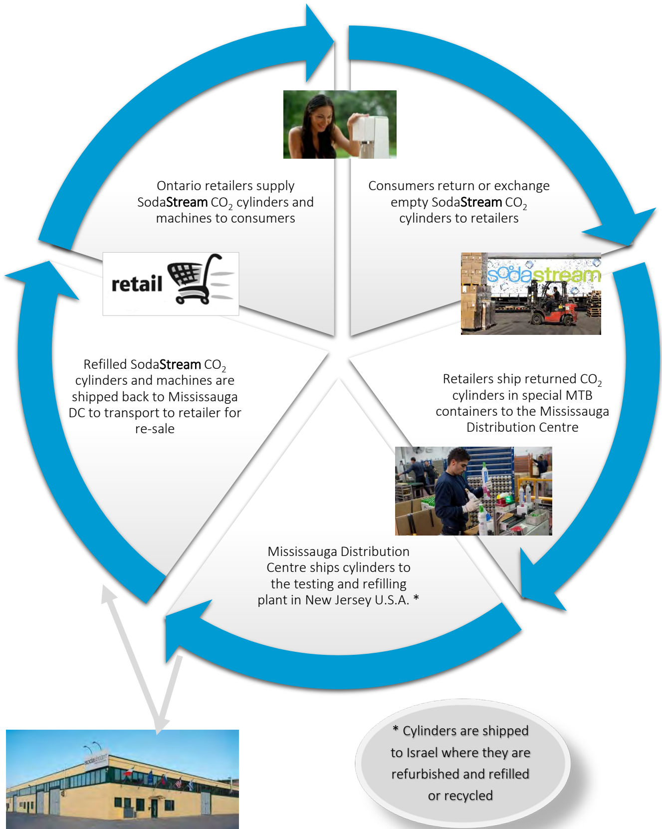
Figure 2: Current SodaStream CO 2 Cylinder Flow