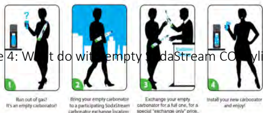
Figure 4: What to do with empty SodaStream CO 2 cylinders?

When your carbonator runs out of gas, you need an EXCHANGE carbonator. Bring your empty carbonator(s) to any participating retail location. The retailer will exchange your empty carbonator for a full one on the spot, for the price of the gas contents only.